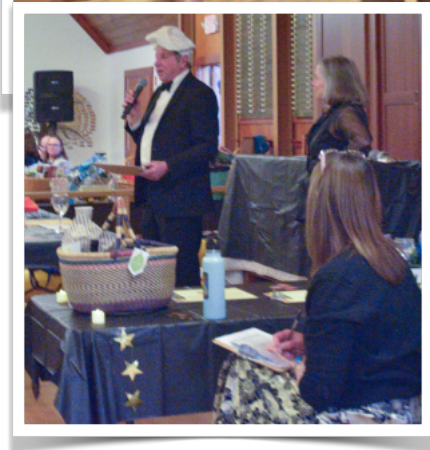
The annual Wine Tasting was a smashing success. We raised nearly $10,000! See more on page 4.